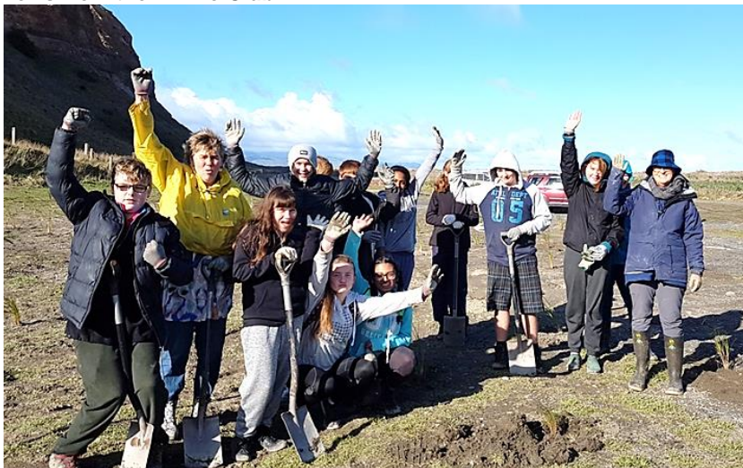
The Enviro Club ready to start planting at Lake Ferry

Three goals have been set this year. One of those goals was to find out more about our waterways in the Wairarapa and develop an Action Plan.